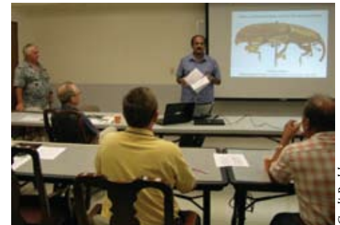
Project director describing the semiochemical techniques to agricultural professionals on Guam..

The purpose of this project was, through training, to build agricultural professionals' understanding of the role of semiochemicals in pest control programs. The training covered the relationship between semiochemical-based trapping methods and overall crop production on Guam for