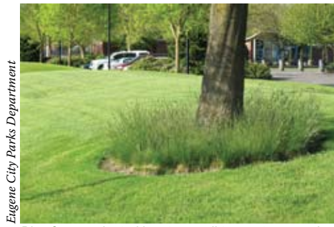
Eugene City Parks Department

Results: The project provided 10 school districts (serving 114,500 students) with new tools for managing landscape pest problems, assisted three schools (serving 3,000 students) to become demonstration sites for landscape IPM, and helped in an ongoing process to have the two school districts